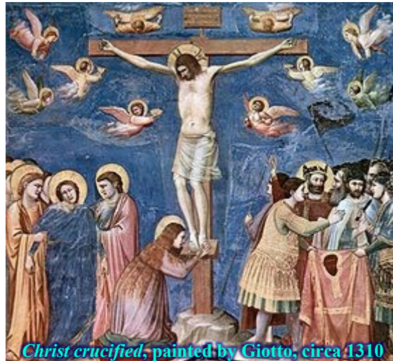
Christ crucified, painted by Giotto, circa 1310